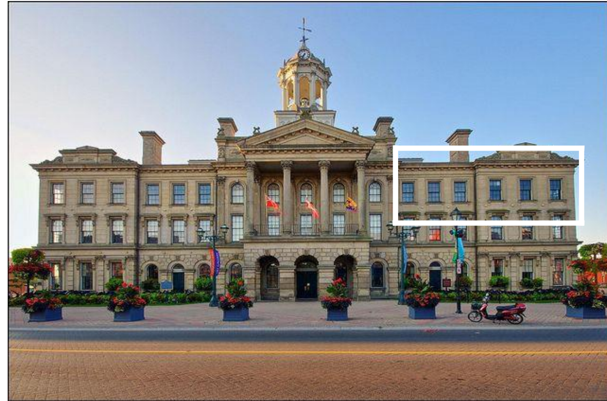
Victoria Hall (opened 1860), West Wing, Third Floor